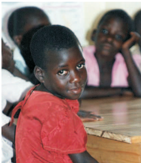
in the nursery school

KCC works in the area around the trading center Kibaale . There is much poverty in this agricultural area, but fortunately there usually is enough food. Drinking water is a bigger problem; there is hardly any clean water to be found. On the KCC project rainwater is harvested and stored in large tanks.