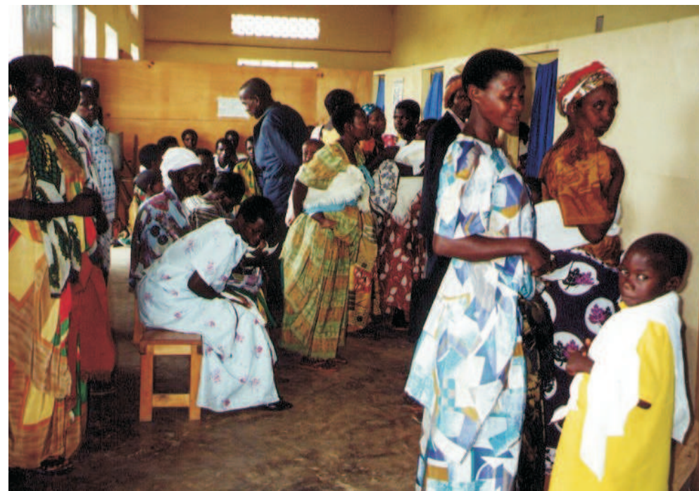
another busy day at the clinic

e-mail: Bram@iccf-holland.org giro: 4548774